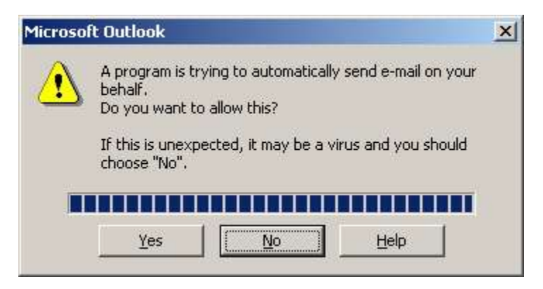
Figure 2: There is a 5-second delay before the "Yes" button enables, thanks to this security patch.

When attempting to send mail on a patched system, you'll see a dialog like Figure 2. There is a five second delay before the "Yes" button is enabled on the dialog.