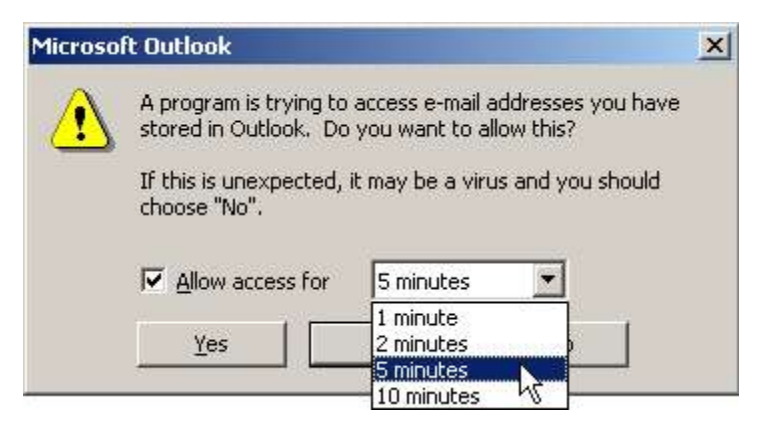
Figure 3: The clock's running for how long you access the Address Book